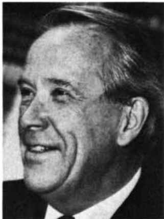
Henry M. JACKSON Democrat