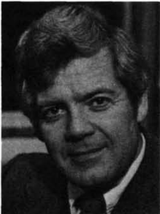
Jim McDERMOTT Democrat

The state of Washington is suffering the worst financial crisis in its history. I am running for re-election to the State Senate because I want to continue working to resolve the crisis. I do not believe that we can make more deep spending cuts in our social, educational, and environmental protection programs without irreparably damaging the special quality of life we enjoy in Washington. The state's sharply reduced bond rating, its high unemployment rate, and its inadequate revenue sources all reflect its need to broaden and diversify its tax base. How to accomplish this task is the major question before the Legislature. Until its basic fiscal problems are resolved, the state cannot properly address its many other areas of responsibility, for example, its common school and higher education systems, its prison and mental health systems, and its services to elderly and handicapped citizens. We cannot afford any more "band-aid" solutions to our budgetary problems. A sales tax on food, increased fees, or temporary surcharges added to existing taxes simply will not meet the state's revenue demands. We need sensible tax reform that is fair to all the people of this state. Please join me in this effort.