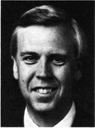
Rod CHANDLER Republican

Rod Chandler strongly believes that balancing the federal budget is the key to bringing down interest rates and getting the economy