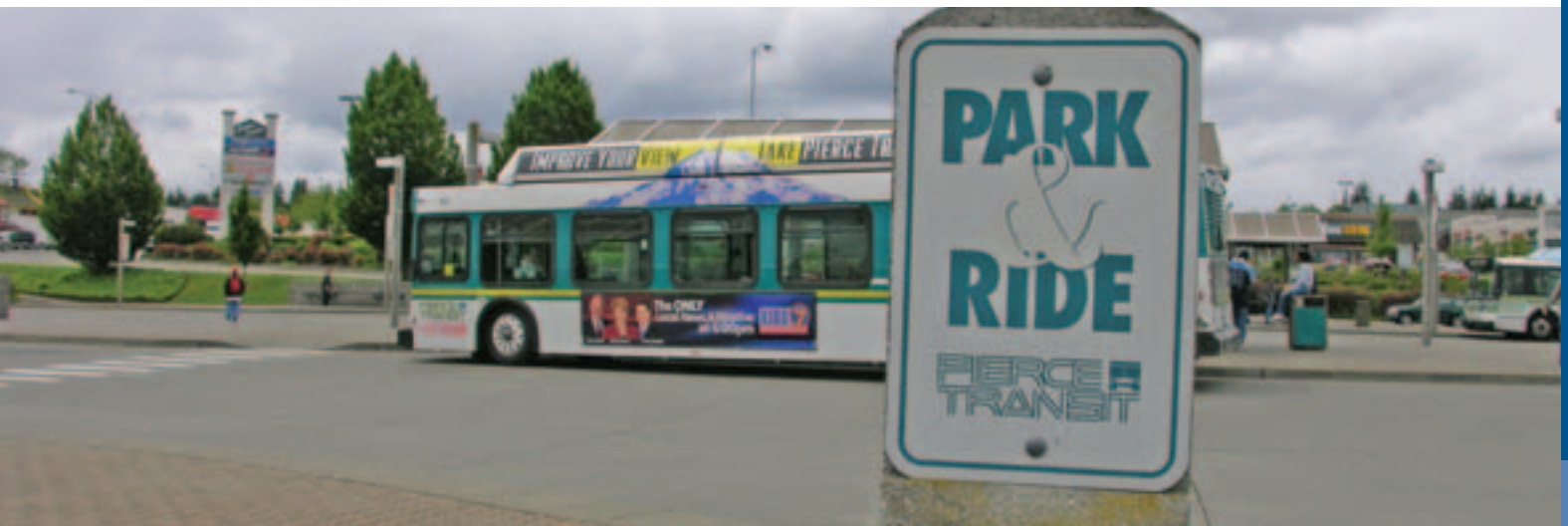
Pierce Transit Park and Ride.