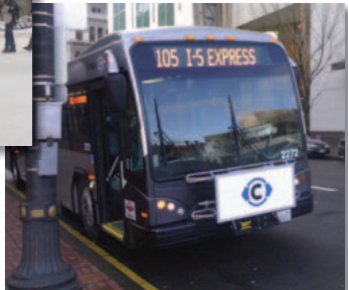
C-Tran provides express service across the state line to job sites in downtown Portland