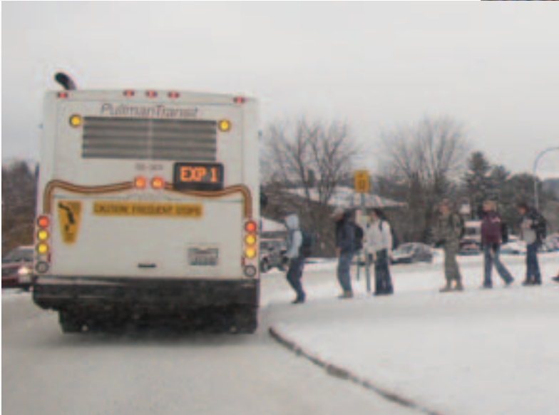
Pullman Transit works closely with WSU to serve students, faculty and staff.