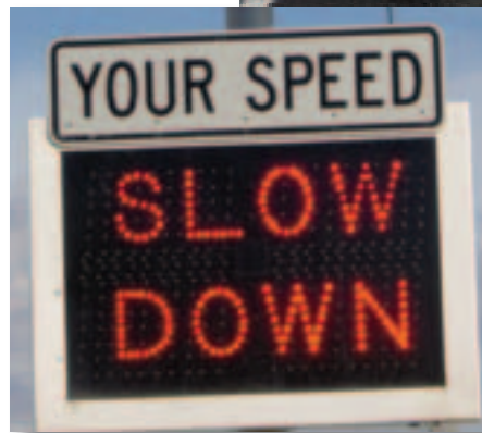
“Slow Down” warning sign on a rural Kittitas County road.