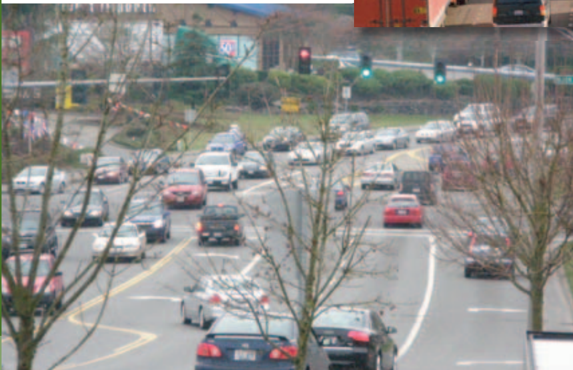
A bottleneck in Olympia and congestion on I-405 demonstrate that transportation infrastructure is often inadequate for actual development activity and travel patterns.