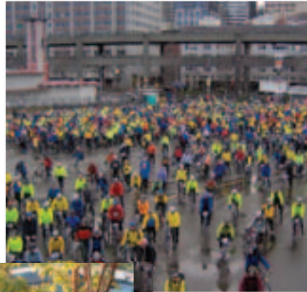
Bicycle riders at Colman Dock, Seattle, prepared for Bainbridge Island's Chilly Hilly, a 33-mile February bike tour just a ferry ride away.