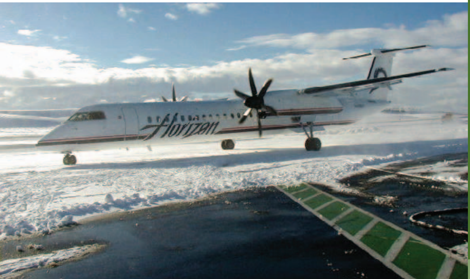
The Horizon Q-400 on the runway in Pullman.

Recommendation: Improving connectivity from one mode to another and between communities merits continued attention and funding.