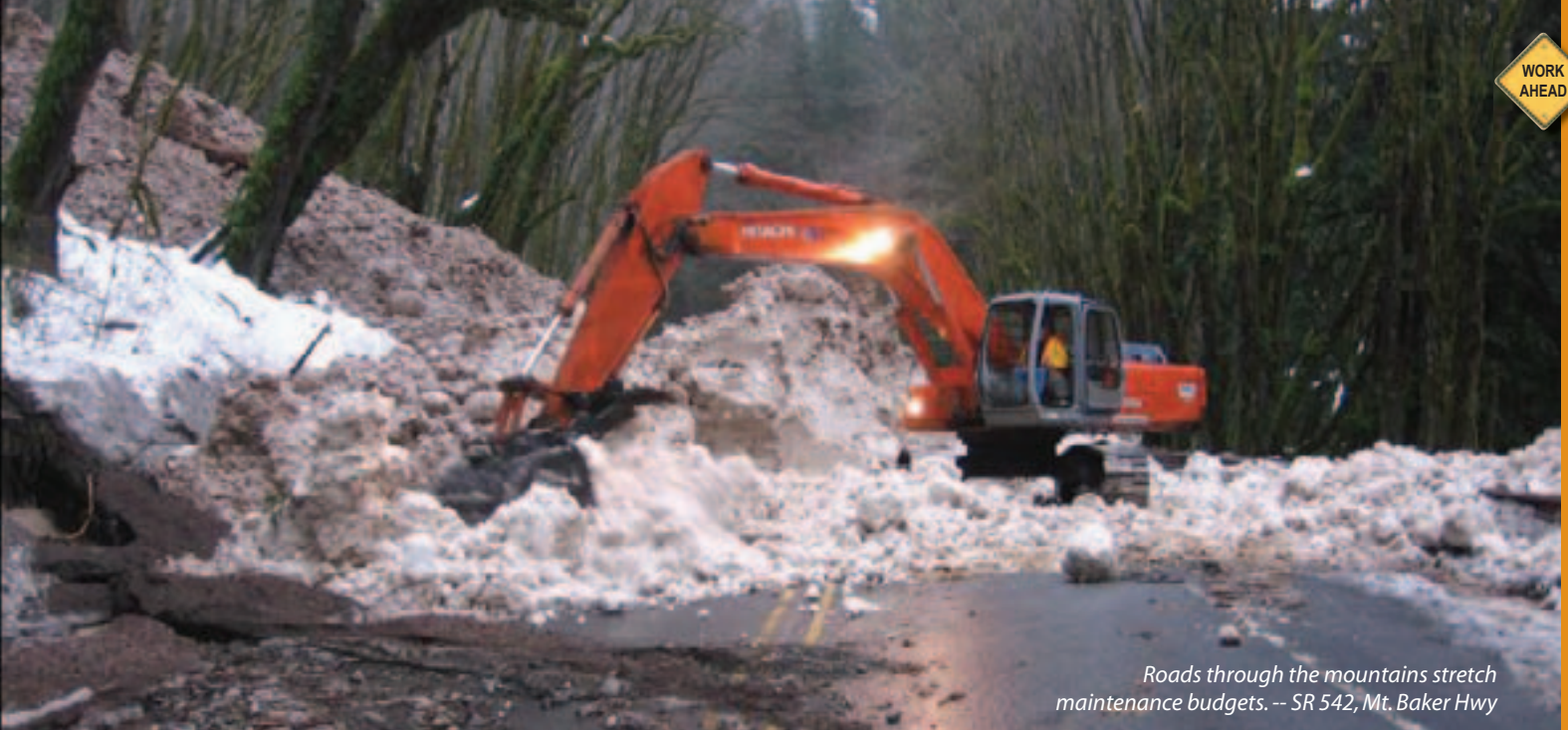
Roads through the mountains stretch maintenance budgets. -- SR 542, Mt. Baker Hwy