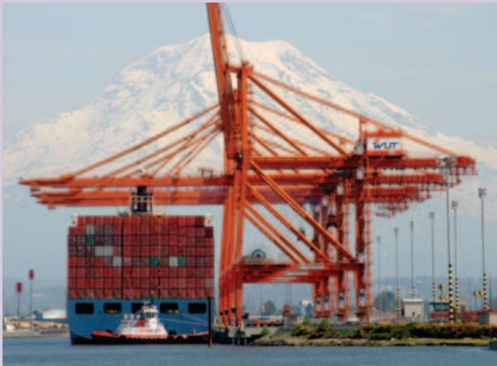
Washington United Terminal uses ultra-low sulfur diesel for all terminal operations at the Port of Tacoma.