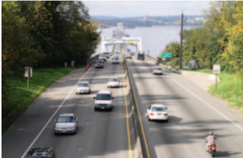
Toll revenue is essential to rebuilding and expanding SR 520.

The Commission also participated in a Puget Sound Regional Council (PSRC) evaluation of pricing strategies. Building on the Traffic Choices Study – an experiment involving over 275 households and over 400 vehicles using road use fees that differentiated between time of day and location using a GPS-based tolling system – PSRC is developing scenarios and using modeling to determine whether and how pricing can reduce traffic congestion and raise revenue for new investment.