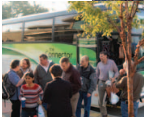
Employees departing The Connector, a private transit system offered free to Microsoft employees providing service from numerous neighborhoods direct to the Redmond Campus.