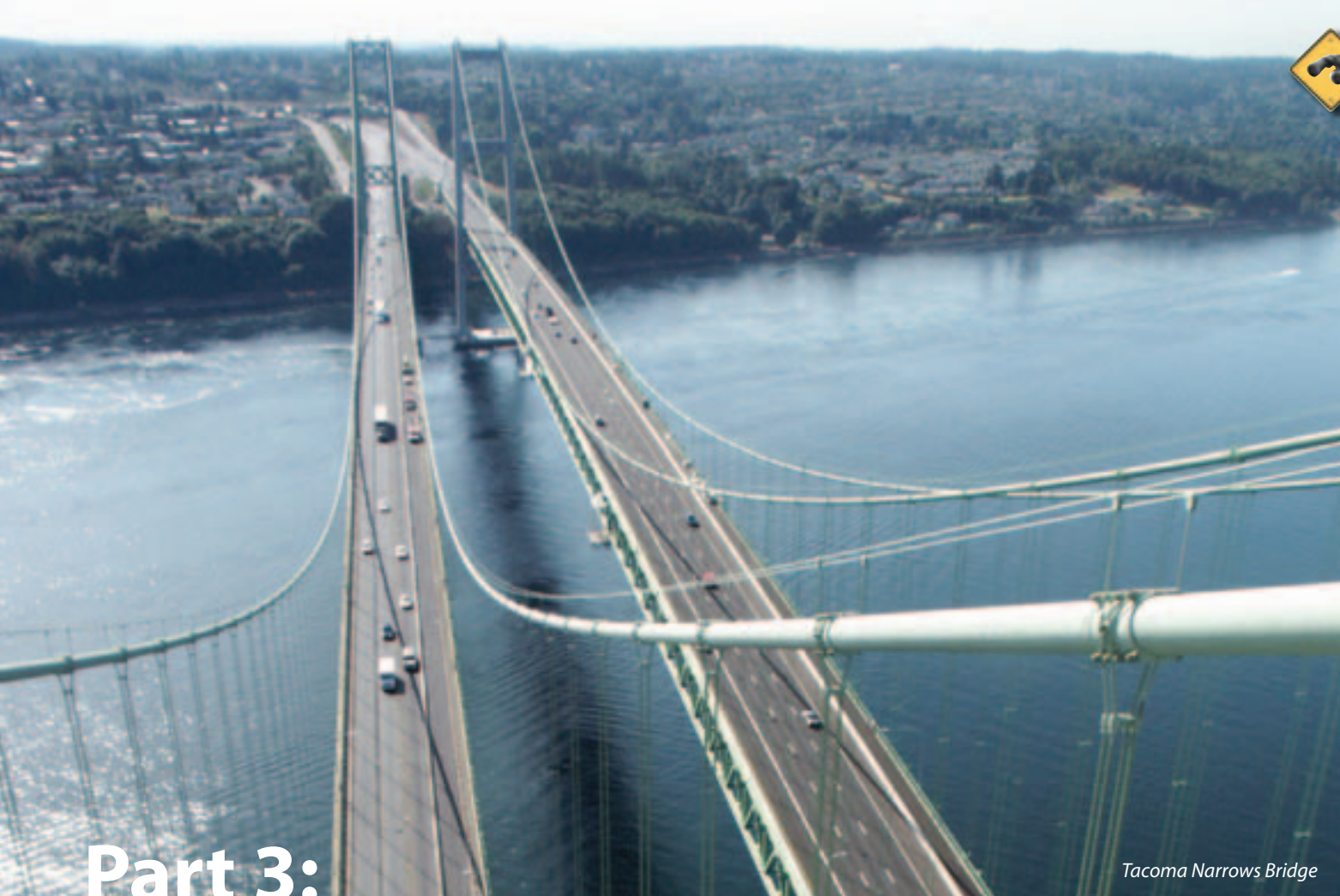
Tacoma Narrows Bridge