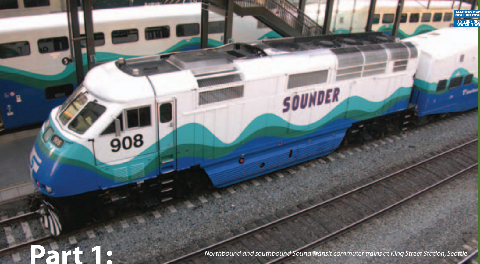
Northbound and southbound Sound Transit commuter trains at King Street Station, Seattle