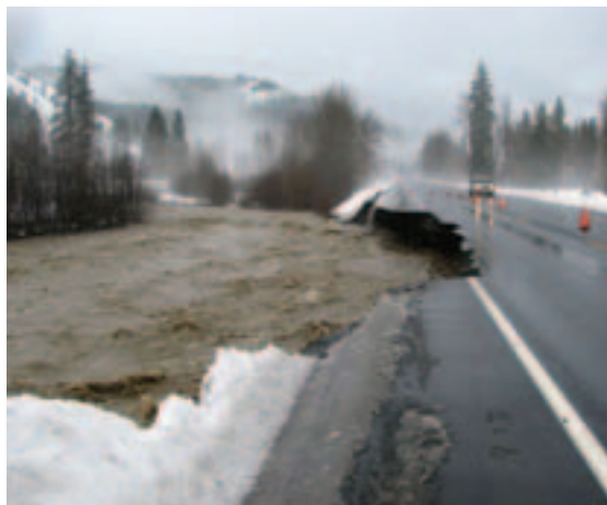
January 10: SR 97 – Blewett Pass.

Although fuel prices have declined significantly since summer, many drivers continue to drive less. As the national economy has crumbled, families still need to conserve fuel and dollars, some drivers want to reduce their carbon footprint, and others have incorporated fewer trips as part of the daily routine. At this time, it is unknown whether a large increase in fuel consumption will follow lower gasoline prices. The challenge facing policymakers is how to optimize mobility in an environment of uncertain revenue, changing expectations and a hurting economy, while moving forward fiscal and policy decisions to create lasting solutions.