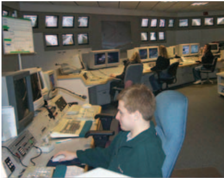
WSDOT Seattle Traffic Management Center.

– Intelligent Transportation Systems are improving mobility without the expense and environmental impacts of building additional lane miles. WSDOT Traffic Operations is implementing signal synchronization and timing efforts, managed lanes, incident response, traffic management centers and traveler information strategies. In addition, through electronic tolling, on SR 167 between Auburn and Renton, drivers are able to purchase excess space in underutilized High Occupancy Vehicle (HOV) lanes and improve travel flow for themselves and (indirectly) for others on the road.