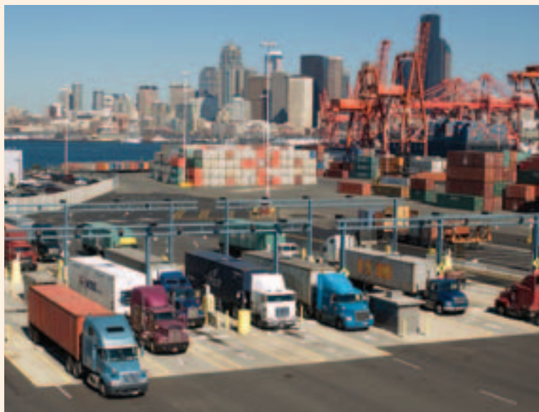
Port of Seattle intermodal operations are critical for international trade.