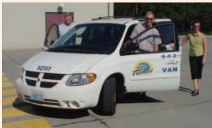
Vanpool opportunities are in demand in the Tri-Cities and across the state