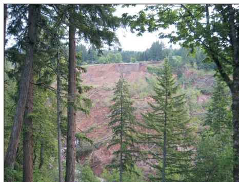
Figure 1. View from Angel Heights showing the newly activated area(s), which are located outside the footprint of the previously reported slide. This new area is from just left of center to the right edge. Most of this dropped on Saturday morning (May 19), with continued activity all weekend. The charred remains of the LaCombe house can be seen at the top of the scarp.

The scarp of the Rock Creek landslide near Stevenson, Wash., continues to move upslope toward a second house. There was increased activity the weekend of May 19 (Figs. 1-2). Material flowed into Rock Creek from across the face of the slide, making the creek a slurry on Saturday. The new activity