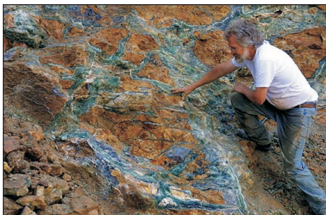
Figure 3. Bob Jackson, owner of the Spruce 16 claim, inspects a mineralized outcrop at an undisclosed location.

Apart from the uses in earthquake hazards studies, a rich collection of projects and investigations is underway using the data from the PSLC, including: