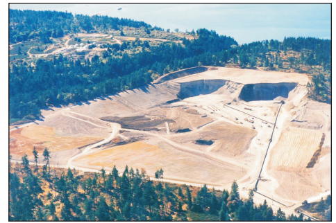
Figure 2. This sand and gravel mine operation near DuPont is using the preferred ‘segmental reclamation’ technique, which begins rehabilitation phases (at left) long before the total mining ends. The active part of the mine is at the right.