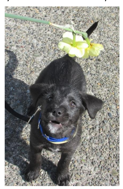
Below: (L) headed for training; (R) Harry – no comment necessary!