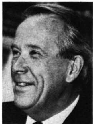
Henry M. JACKSON Democrat