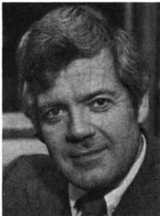
Jim McDERMOTT Democrat

The state of Washington is suffering the worst financial crisis in its history. I am running for re-election to the State Senate because I want to continue working to resolve the crisis. I do not believe that we can make more deep spending cuts in our social, educational, and environmental protection programs without irreparably damaging the special quality of life we enjoy in Washington. The state's sharply reduced bond rating, its high unemployment rate, and its inadequate revenue sources all reflect its need to broaden and diversify its tax base. How to accomplish this task is the major question before the Legislature. Until its basic fiscal problems are resolved, the state cannot properly address its many other areas of responsibility, for example, its common school and higher education systems, its prison and mental health systems, and its services to elderly and handicapped citizens. We cannot afford any more "band-aid" solutions to our budgetary problems. A sales tax on food, increased fees, or temporary surcharges added to existing taxes simply will not meet the state's revenue demands. We need sensible tax reform that is fair to all the people of this state. Please join me in this effort.