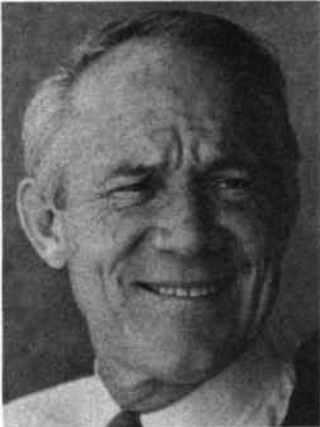
Joel PRITCHARD Republican

Congressman Joel Pritchard believes Congress can and must play a more constructive role in controlling government spending, strengthening the economy and reducing the prospect of global conflict.