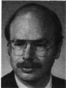
Ray E. JOHNSON Republican

Ray E. Johnson feels the people of Washington state are too heavily taxed. There is an effort by the incumbent to institute an additional state individual income tax which would only feed the fires of runaway spending. Johnson can better represent the people of the 2nd district whose wishes have been ignored and compromised by the incumbent through support of special interest legislation.