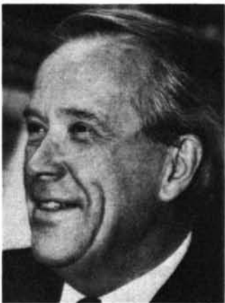
Henry M. JACKSON Democrat