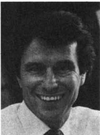
Donald L. BONKER Democrat

Voters are switching to Quigg, because we all know it's time for a change. It's time we put people back to work.