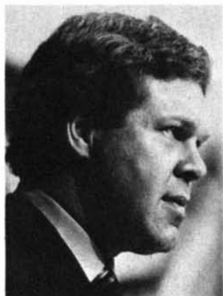
Norman D. DICKS Democrat

He is a consistent advocate of women's rights, private sector development of energy alternatives and the concerns of today's small businesses.