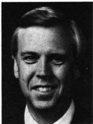
Rod CHANDLER Republican

Rod Chandler strongly believes that balancing the federal budget is the key to bringing down interest rates and getting the economy