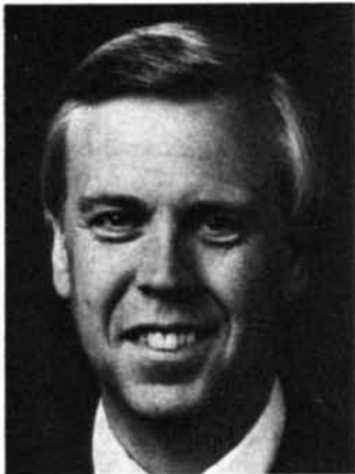
Rod CHANDLER Republican

Rod Chandler strongly believes that balancing the federal budget is the key to bringing down interest rates and getting the economy