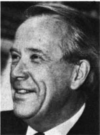
Henry M. JACKSON Democrat