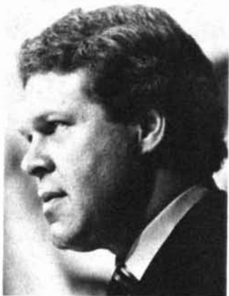
Norman D. DICKS Democrat

He is a consistent advocate of women's rights, private sector development of energy alternatives and the concerns of today's small businesses.