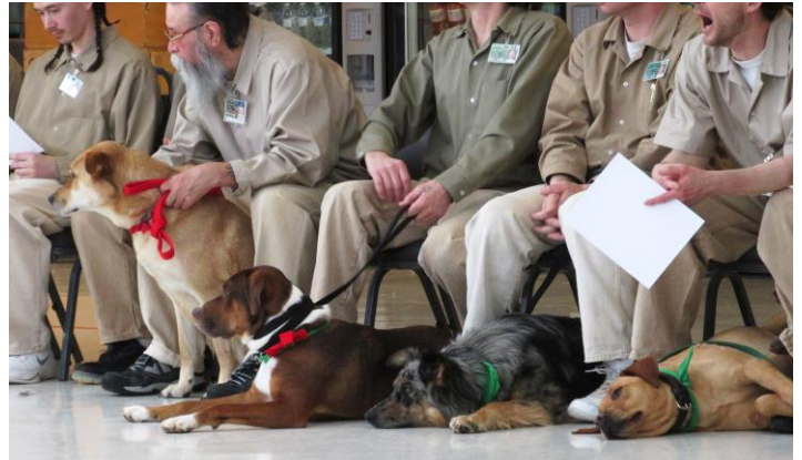
Someone or something has their attention!