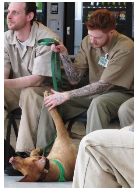
The gift of touch.