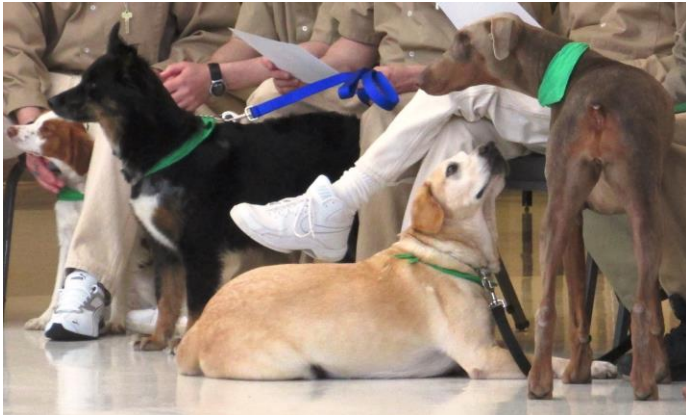
Pssst – wanta go play?