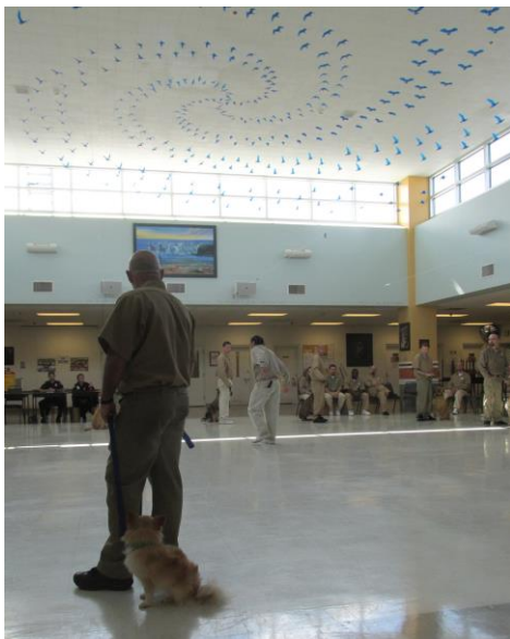
Dogs and birds circle the room.