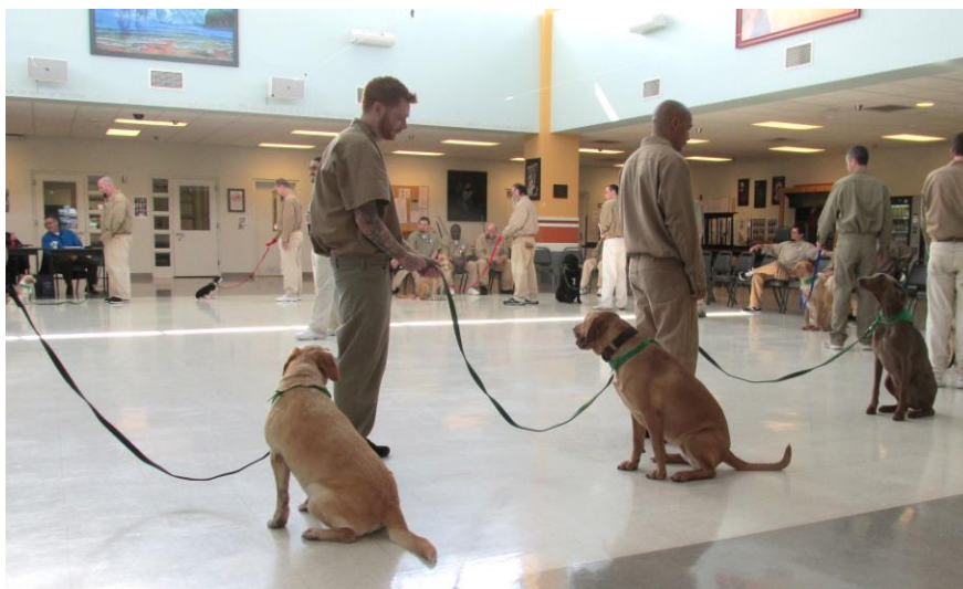
Nope, it's not one big leash.