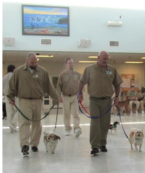
We ARE big dogs!