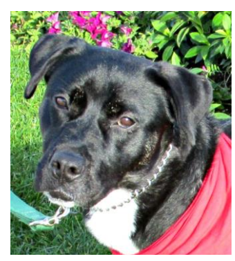
Another beautiful face – and a tail that wags too fast for a camera!