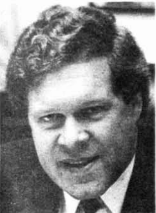
Norm DICKS Democrat