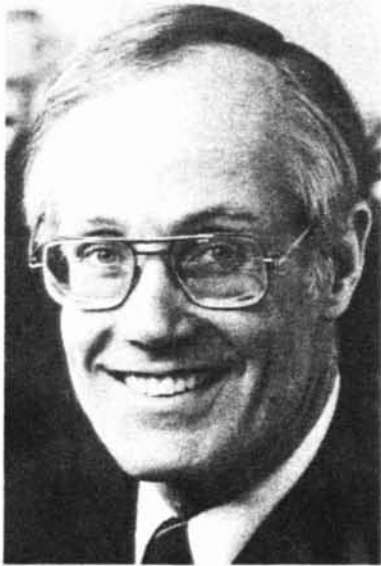
Slade GORTON Republican

Only a handful of men and women in Washington State history have devoted as much of their lives to public service as has Slade Gorton.