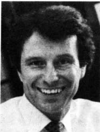
Don BONKER Democrat

Joe is actively involved in community and church activities in Olympia."