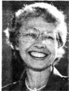
Jolene UNSOELD Democrat

"As a business owner I have found it almost impossible to stay in business. You can't tax people and expect to have prosperity. We need a climate that encourages free enterprise, strong families and more spendable income per household. We need more jobs, not more taxes."