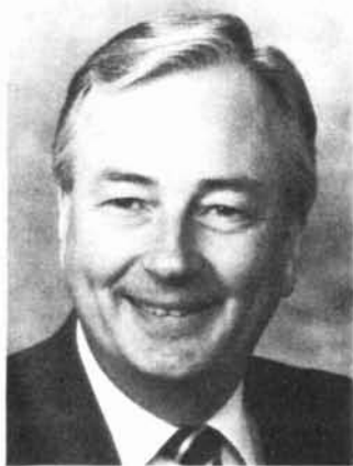
Al SWIFT Democrat