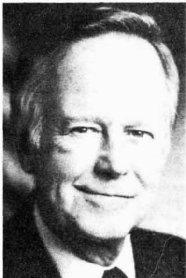
Brock ADAMS Democrat

We have a lot to be proud of in Washington State. But we need new leadership and long-range vision to help us reach our full potential. I grew up here and I understand how important it is for our Senators to fight for us. It's what we in Washington expect. I have always fought for Washington State.