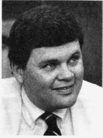
Greg NICKELS Democrat