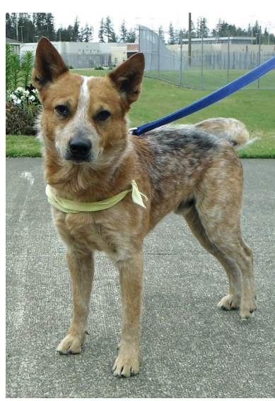
TABASCO: is a very, very sweet 4