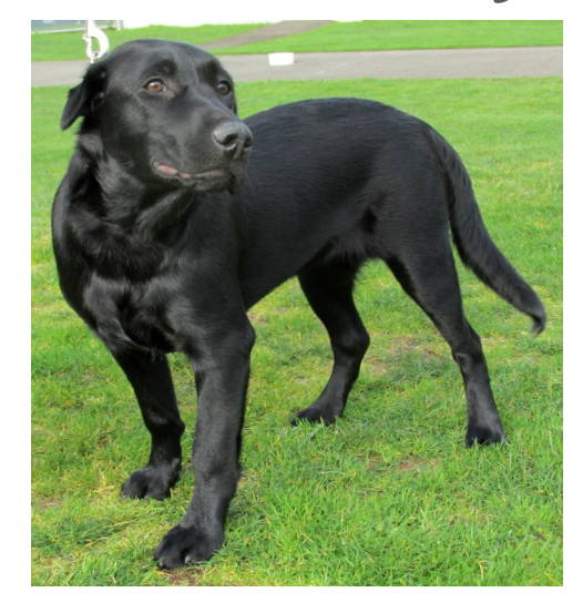
NEMO: is a very special little 9-month