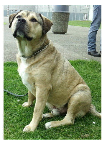
DRACO: is a 119.5lb, 5 1/2 year

young Husky mix is a very intelligent boy and still a pup at heart. Riley is high energy, but is very relaxed when asked to be. He will need a home with a fenced yard, and one that can give him lots of exercise. He also needs a home with no cats, birds, or other livestockbut other dogs are just fine. Riley loves humans, is a snuggle bug, and has an amazingly soft coat. (Long Beach Humane Society)