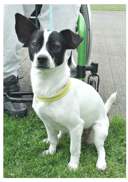
ROLO: Is a 1 year old, microchipped,

17lbs Jack Russel/Rat Terrier Mix. Surprisingly, Rolo does not meet the typical little -dog stereotype, he is filled with lots of goodness and love, and no aggression issues! Rolo is great with all dogs, cats and people. His energy level is oddly not on the higher end as you would expect from his combination of breeds, but still being a pup he will require lots of daily exercise, socialization, and love. (Long Beach Humane Society - Oregon Friends of Shelter Animals)