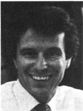
Donald L. BONKER Democrat

Voters are switching to Quigg, because we all know it's time for a change. It's time we put people back to work.