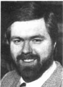
Dennis L. HECK Democrat