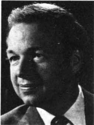
Sid MORRISON Republican

Congressman Sid Morrison is seeking a second term as Fourth District Representative. A 14-year veteran of the Washington state legislature, Morrison brings experience and understanding of the varied needs of his constituents.